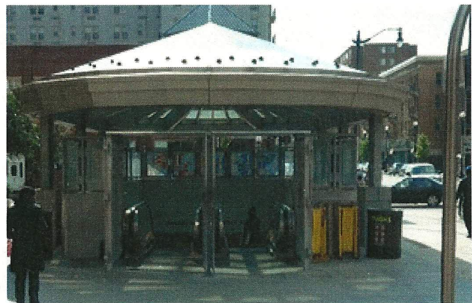
East side of the Columbia Heights entrance

Closure of the east side of the station's entrance (towards Pleasant Plains). Customers will continue to have access to the station's west side of the entrance during construction. The street elevator will also be in service during this time.