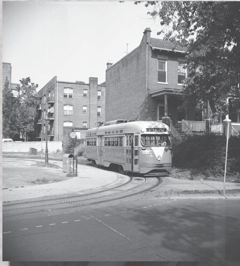
Streetcar at 11th and Monroe

Streetcar 1587, pictured below, was powered by ground electricity (notice no overhead wires). This model was produced by the St. Louis Company in 1937, and featured windshield wipers, door engines, compressed air brakes and air conditioning. This car ran on the 14th Street Line for 25 years.