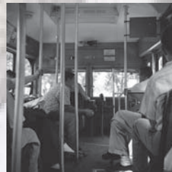
A look inside