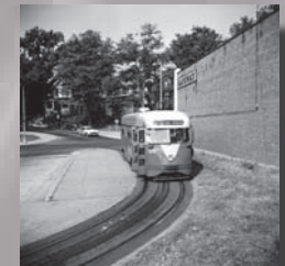
14th and Colorado