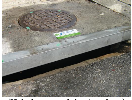
(Help keep catch basins clean)

• Don't throw trash on city streets or in alleys. How long could you survive without water and sewer services? We all take for granted that we'll have water with which to cook, to wash, to drink, and to brush our teeth, and that our toilets will flush. Yet, some families are struggling to pay their water and sewer bills and are in jeopardy of losing these critical services. (from DCWater's What's on Tap?)