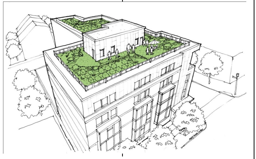
(Sketch of The Avenue showing basic design of the green roof)

issues from the May 2011 meeting, the chief concerns continue to be the health of students and faculty and the state of the cafeteria.