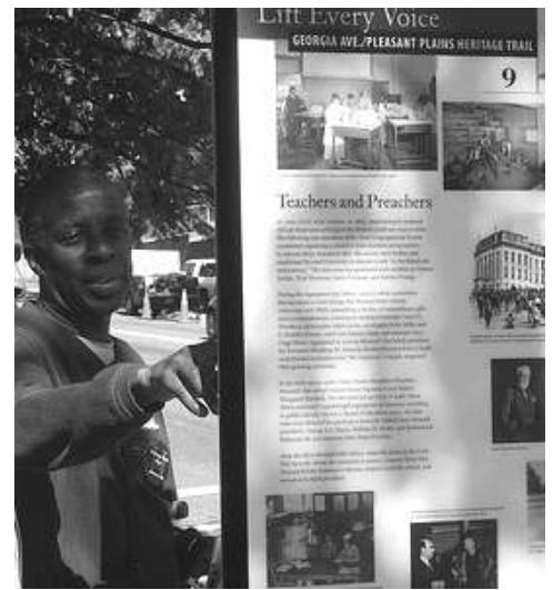
Luke Wassum via Flickr

The club is operated by J & L Green Farm, a popular meat and egg vendor at Petworth Market. Their farm is located in Edinburg, VA where they raise animals with people-friendly, animal-friendly, and earth-friendly practices, mimicking natural habitats and symbiotic relationships, using no steroids, hormones, or systemic antibiotics. All grains are GMO-free and locally produced. Learn more at www.jlgreenfarm.blogspot.com