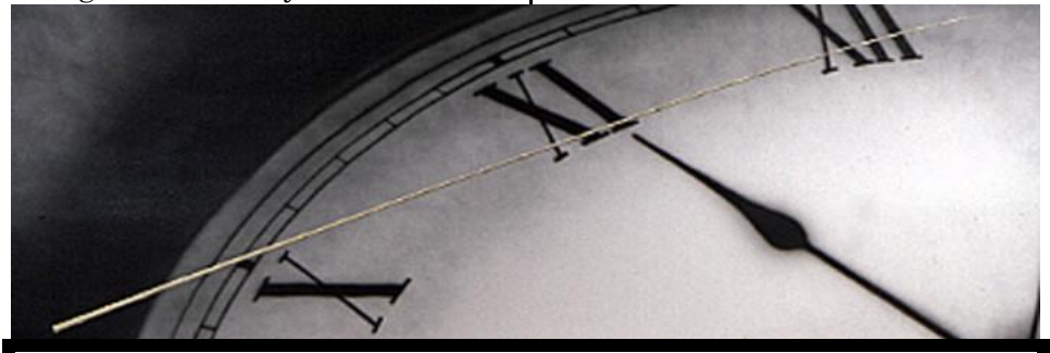
Reminder: Daylight Savings Time ends on Sunday, November 6, at 2:00 a.m. Remember to set you clocks back an hour accordingly.